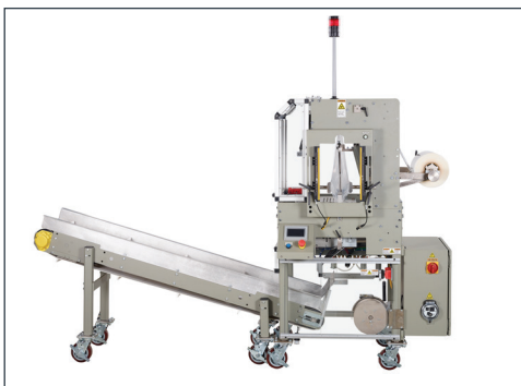
RENNCO MODEL 201