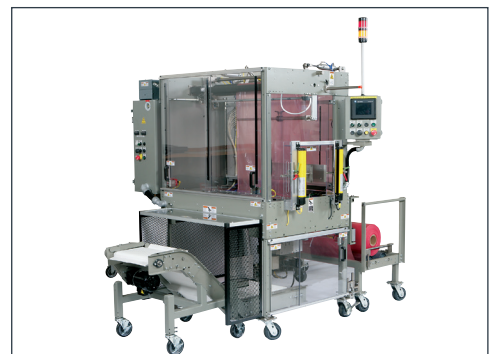
RENNCO MODEL 501

©2022 ProMach Inc. ProMach reserves the right to change or discontinue specifications and designs shown in this brochure without notice or recourse