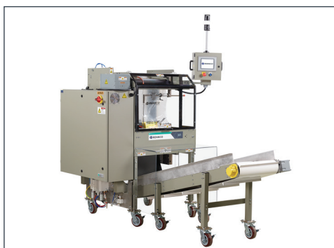
RENNCO MODEL 301